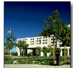
San Ramon Marriott Hotel

On February 28, researchers from Lawrence Livermore National Laboratory will present their latest developments on the topics of waste treatment, remote sensing and ecological implications of waste facilities. On March 1, LLNL will host a tour of their Site 300 facility .